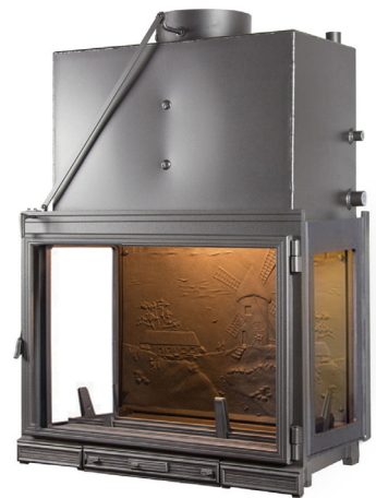
Multivision Hydro80 3V