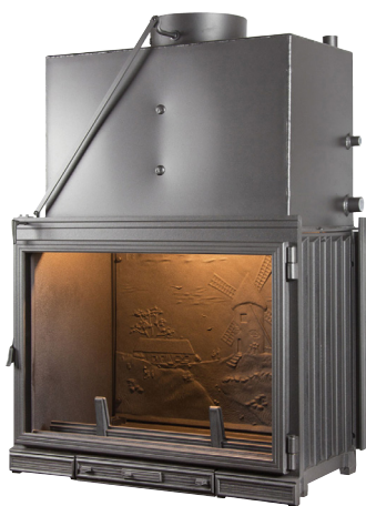
Multivision Hydro80 Single Sided

Hand crafted with raw materials to produce world class elegance and outstanding heating performance, the Seguin Multivision Hydro80 has been engineered to encapsulate your entire home heating solution. This sustainable heating solution delivers superior heat output, delivering heating via your in floor heating systems or radiator panels. The Seguin Multivision Hydro80 provides an efficient solution to your heating needs. Through versatility incorporated into simplicity this design is the ideal solution to heat your home comfortably.