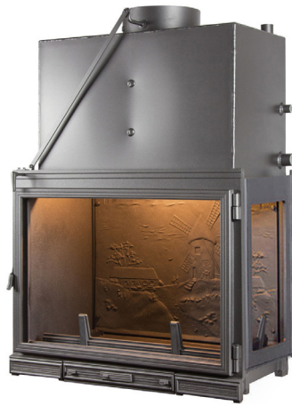
Multivision Hydro80 VL